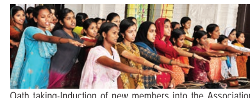
Oath taking-Induction of new members into the Association