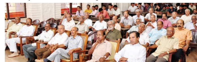
Alumni Day 2011 - A view of the audience