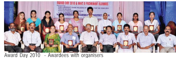
Award Day 2010 - Awardees with organisers