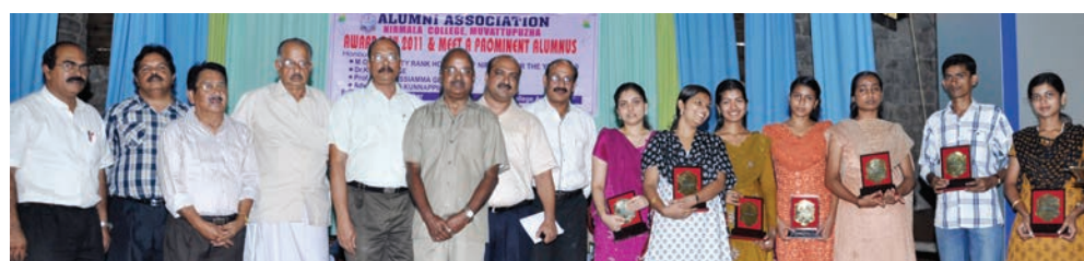
Award Day 2011 (Honouring rank holders) and Meet-a-Prominent Alumnus: Awardees with guests and organisers