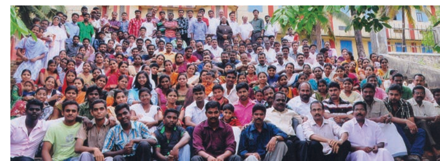
Alumni Meet of NSS Volunteers and Programme Officers