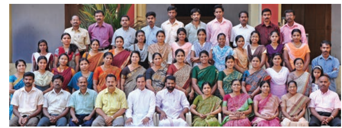
Statistics Silver Jubilee Alumni Meet