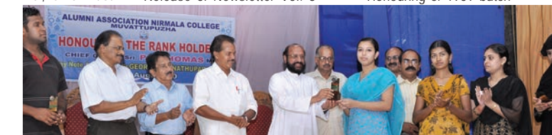
Abi, Cine Artist Release of Newsletter Vol. 8 Honouring of 1959 batch